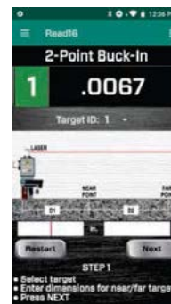
2-point Buck-In Step 1: Enter Dimensions