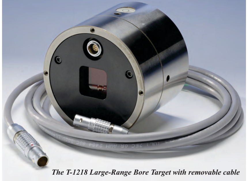
The T-1218 Large-Range Bore Target with removable cable