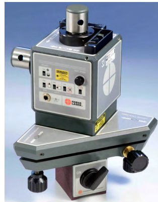
L-733 Precision Triple Scan® Laser

L-743 Ultra-Precision Triple Scan® Laser Ultra-precise, used for more demanding “mission critical” tasks (e.g. aligning complex machine tool geometry, etc.)