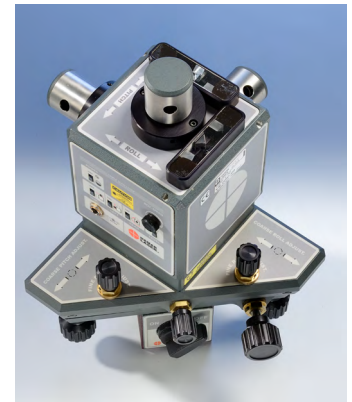
L-743 Ultra-Precision Triple Scan® Laser